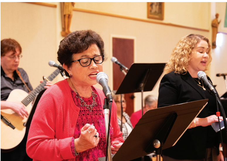
Celebration