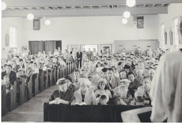
◀ Mass at Our Lady of Grace Parish in Castro Valley, circa 1956.